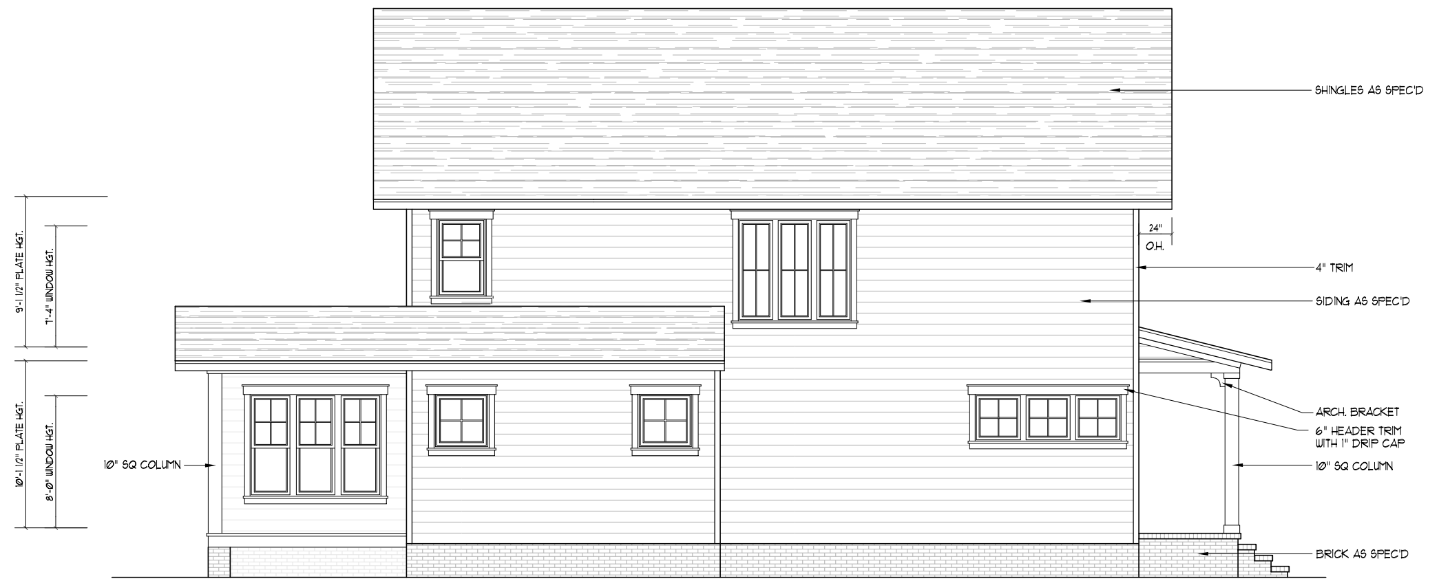
LEFT SIDE ELEVATION SCALE: ----- 1/8" = 1'-0"