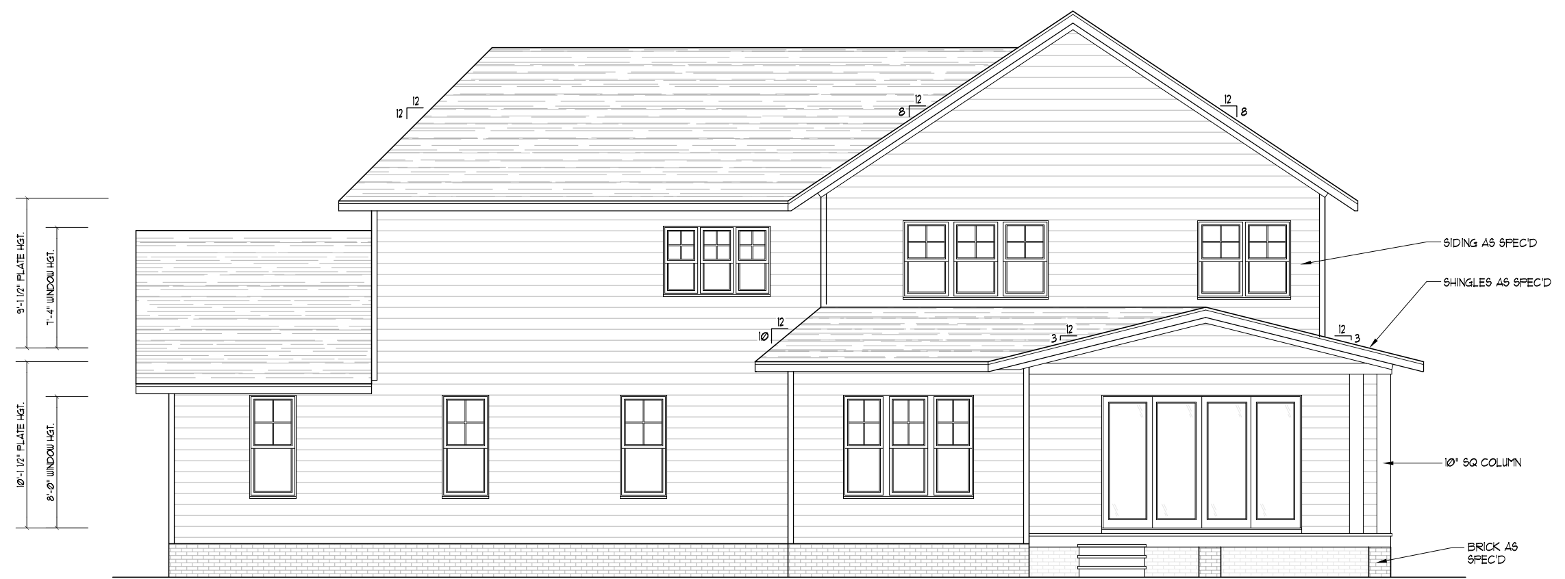
REAR ELEVATION SCALE: ----- 1/8" = 1'-0"