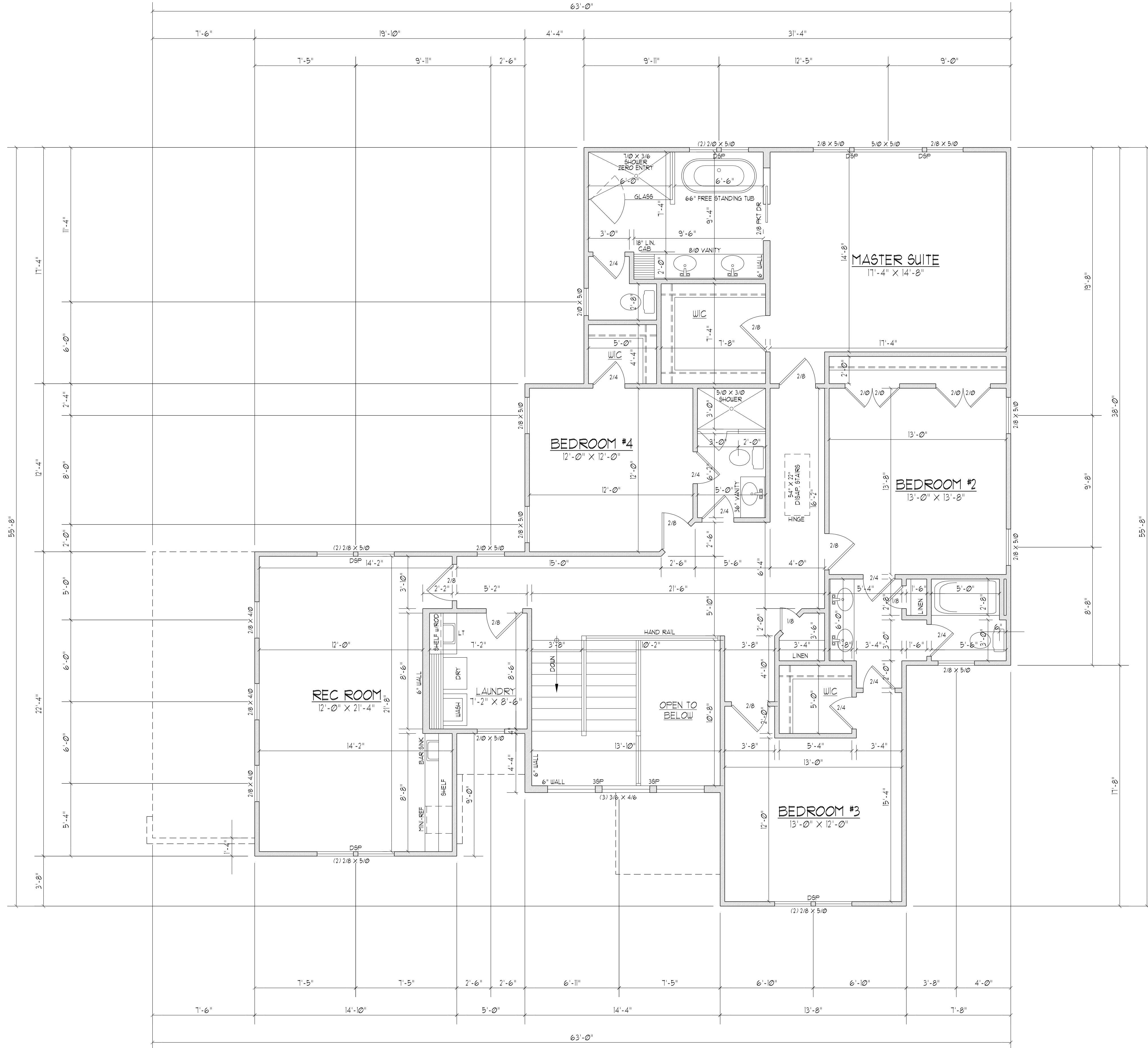
SECOND FLOOR PLAN SCALE ..... 1/4"=1'-0"