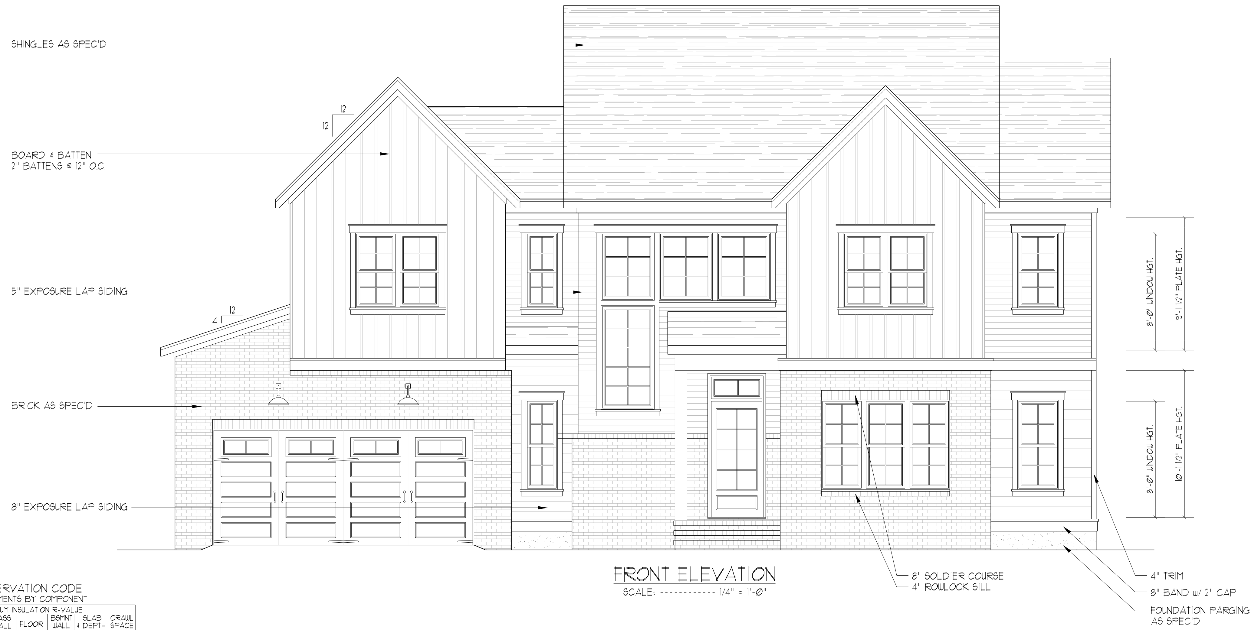
FRONT ELEVATION SCALE: ..... 1/4" = 1'-0"