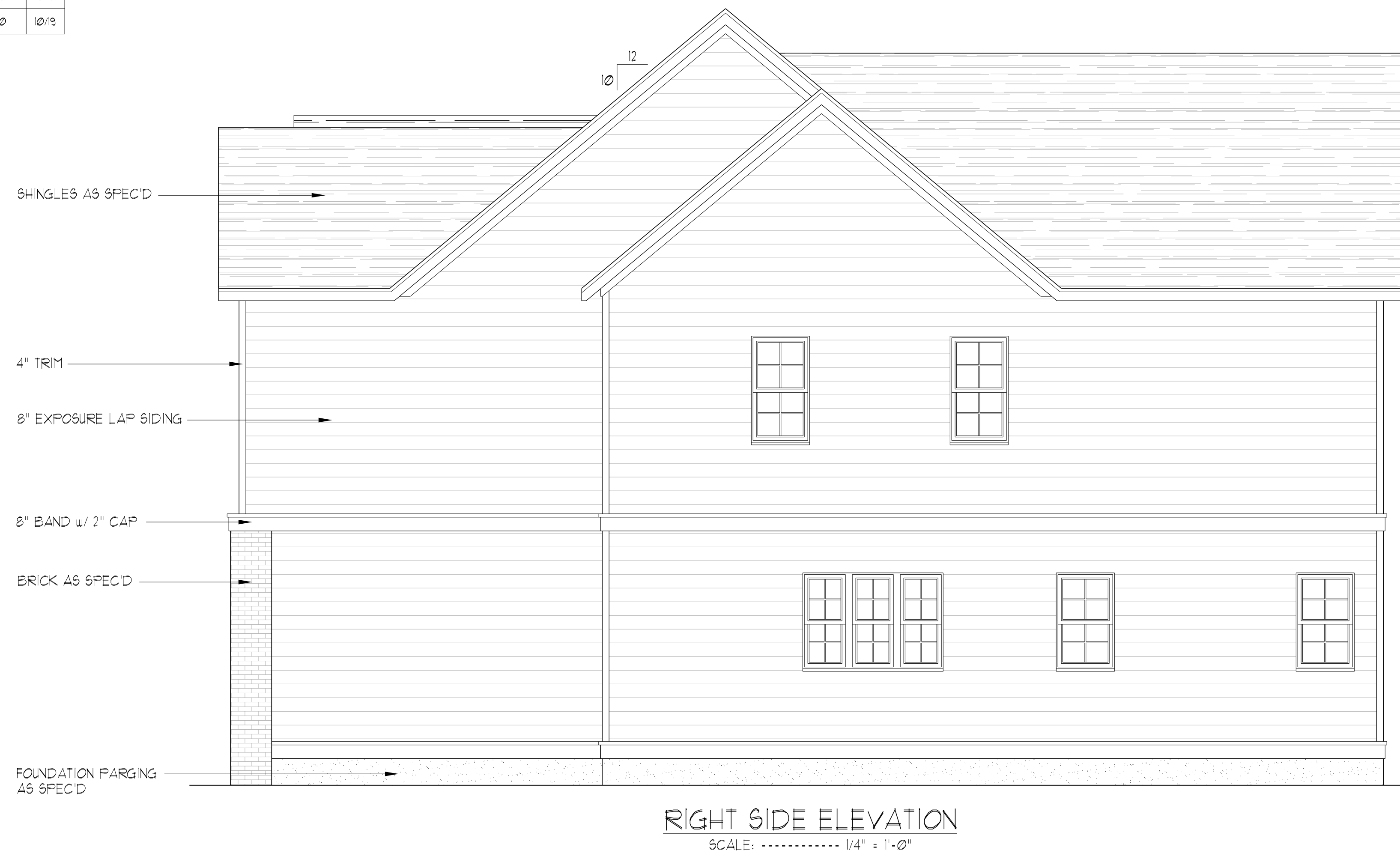
RIGHT SIDE ELEVATION SCALE: ..... 1/4" = 1'-0"

SEE TABLE 301.1 CLIMATE ZONES BY COUNTY ENERGY CONSERVATION CODE SEE FOOTNOTES OF TABLE N102.1 FOR FOOTNOTES AND DETAILED EXPLANATIONS.